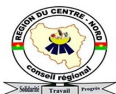
Government of Centre-Nord