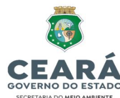
Government of Ceará