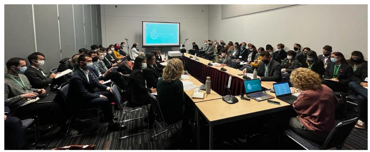
Speakers and attendees of the official side event "Local solutions to global problems: how the Edinburgh Declaration highlights the critical role played by local, regional and subnational governments in delivering the post-2020 global biodiversity framework"

Pavilion event: RegionsWithNature catalyzing biodiversity action and resources for implementation