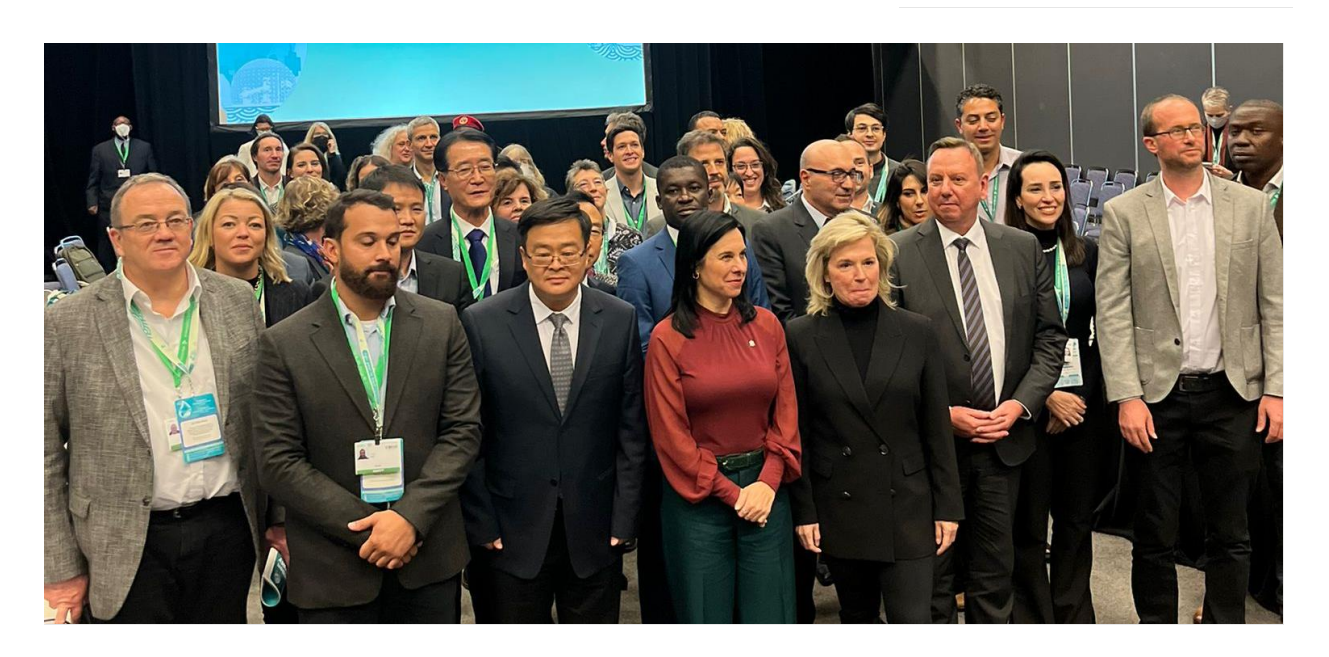
Local and Subnational leaders gathered at the Pre-Summit closed event for Mayors and Governors

Event: Business and finance needs for mandatory requirements to assess and disclosure impacts and dependencies on nature (target 15)