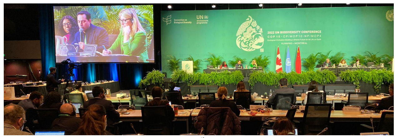
Governor of Yucatan, Mauricio Vila, intervening in the 7<sup>th</sup> Summit for Subnational Governments and Cities

From Regions4, 14 high level representatives from Quebec, Jalisco, Scotland, Lombardy, Wales, Parana, Catalonia, Rio de Janeiro and Basque Country had speaking opportunities and shared efforts, ideas and strong messages about their role in protecting biodiversity and implementing the post-2020 Global Biodiversity Framework.