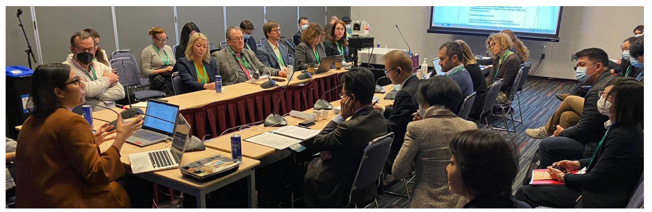
AC SNG members and observers at the in-person AC SNG Executive Meeting

An invitation was launched to observer regions and all subnational leaders to join and engage in the advocacy efforts of the AC SNG as much still needs to be done at the heart of the CBD, particularly on the topic of monitoring and reporting of the new global framework and its 23 targets.