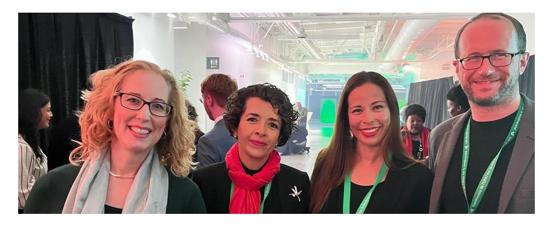
Regions4 members and friends at the Regions4 Cocktail reception