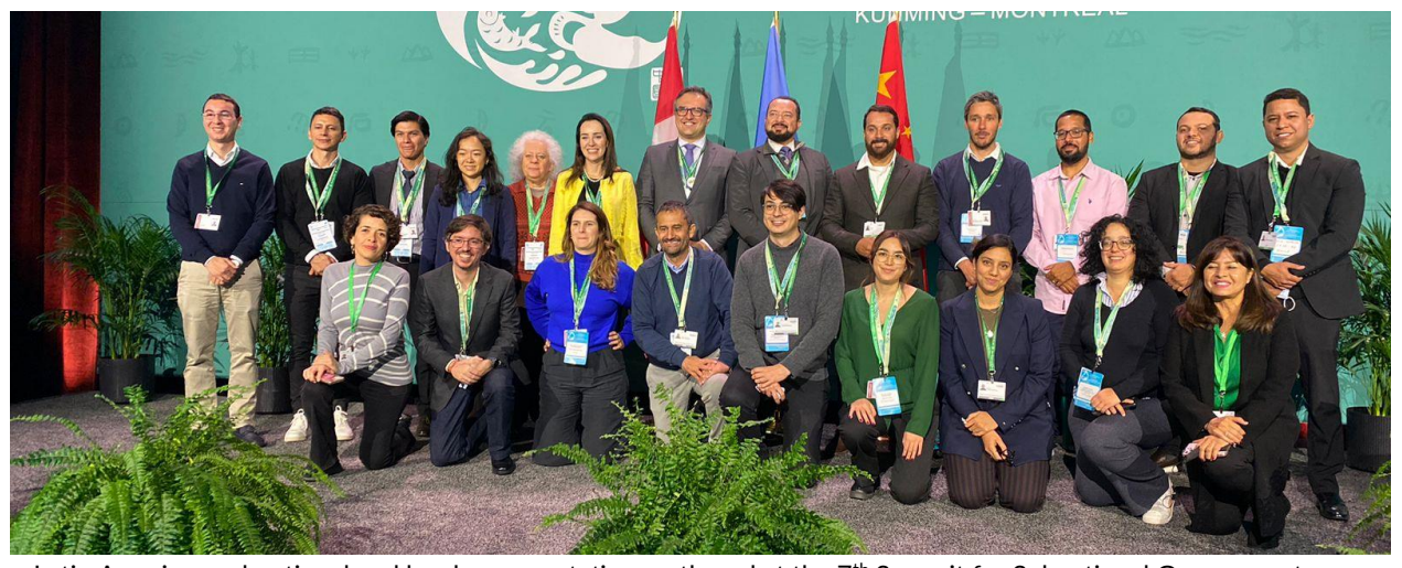
Latin American subnational and local representatives gathered at the 7<sup>th</sup> Summit for Subnational Governments and Cities