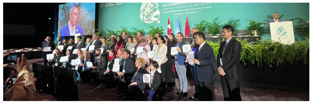
RegionsWithNature pioneer members present at the 7<sup>th</sup> Summit for Subnational Governments and Cities and CitiesWithNature new members, after receiving a badge in the ceremony of the launch of the RegionsWithNature platform

Moreover, the second day of the Summit was the official launch of the RegionsWithNature platform and its featured tool, the Case Study Database. This ceremony gave a special recognition to RegionsWithNature's Pioneer Members, including 10 Regions4 members: Jalisco, Guanajuato, Yucatán, Sao Paulo, Paraná, Rio de Janeiro, Catalonia, Scotland, Lombardy and Quebec, additionally, California was also celebrated as the most recent RwN member. Non-present Pioneer Members include: Åland Island, Campeche, La Rioja, Basque Country, Goa, Pernambuco, Western Cape, the Community of Madrid.